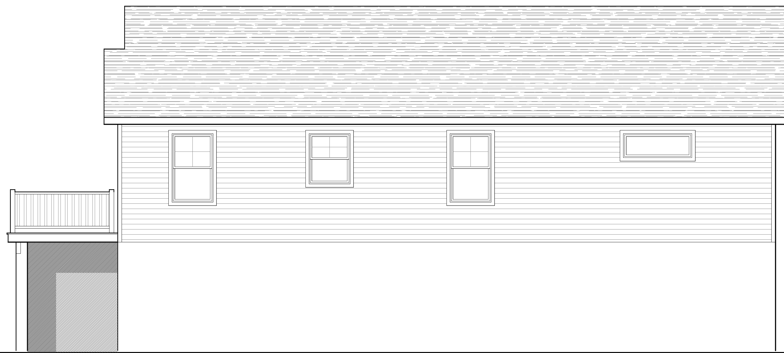
C RIGHT ELEVATION

HEAD HT. 6'-11" 8'-11" 8'-2" 25'-4" 4'-8-1/2" VARIES