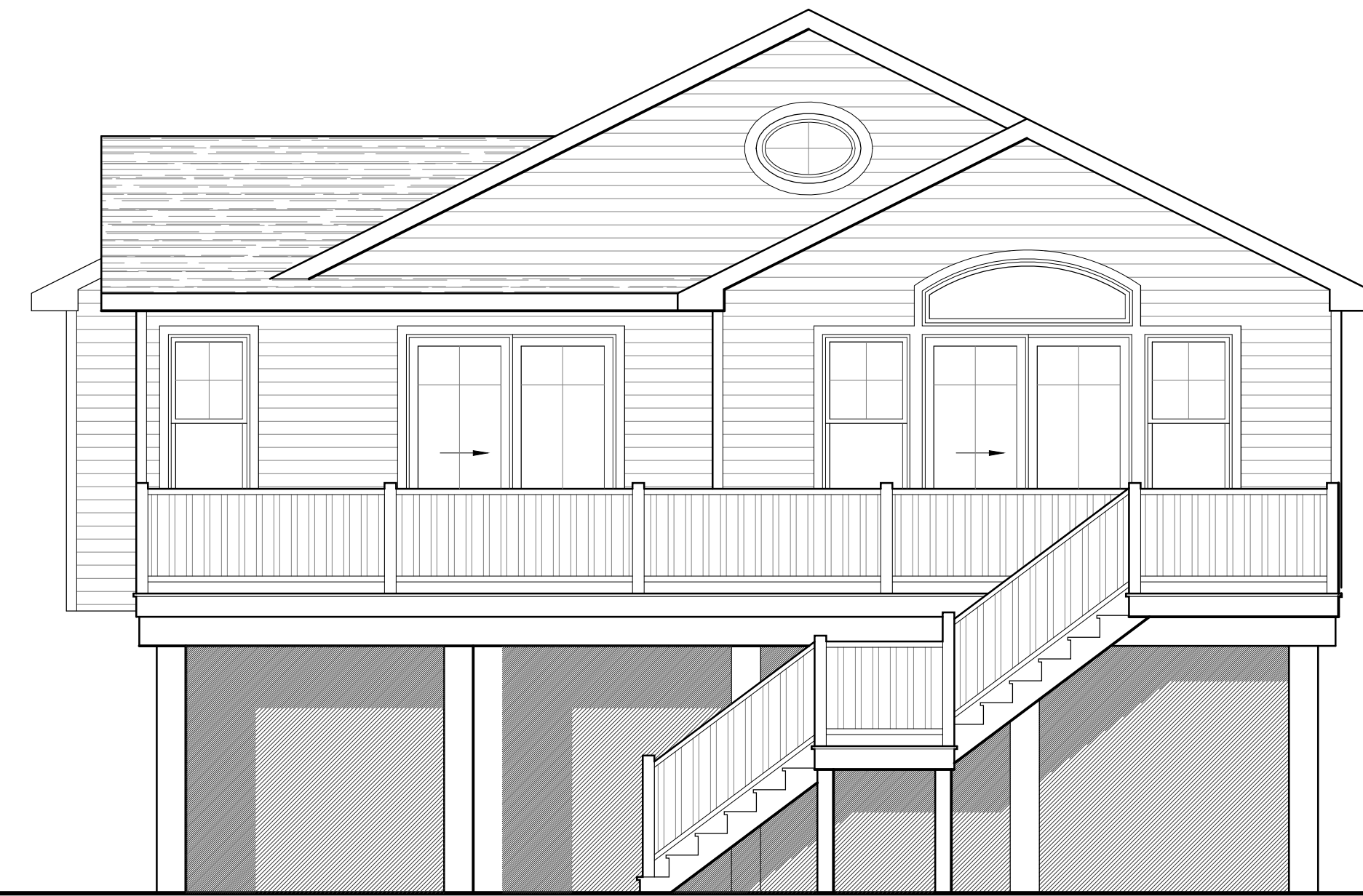
B REAR ELEVATION (LAGOON)

HEAD HT. 6'-11" 8'-11" 8'-2" 25'-4" 4'-8-1/2" VARIES