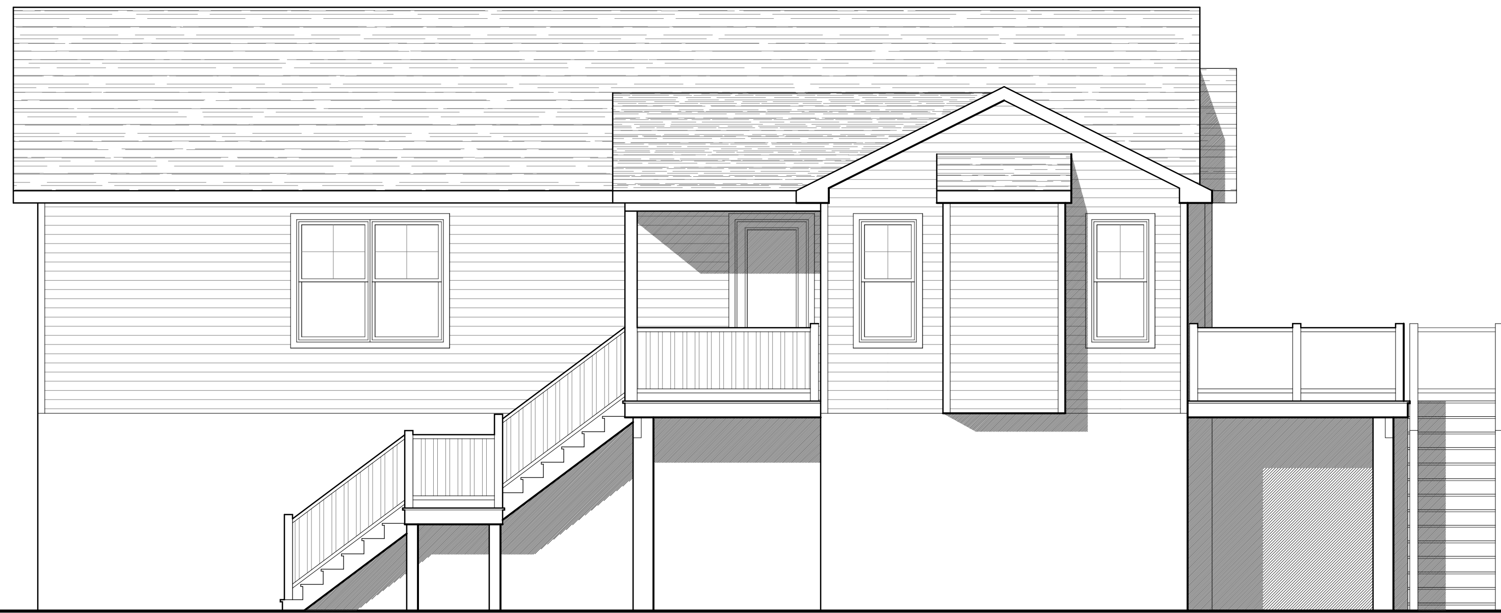
A RIGHT ELEVATION