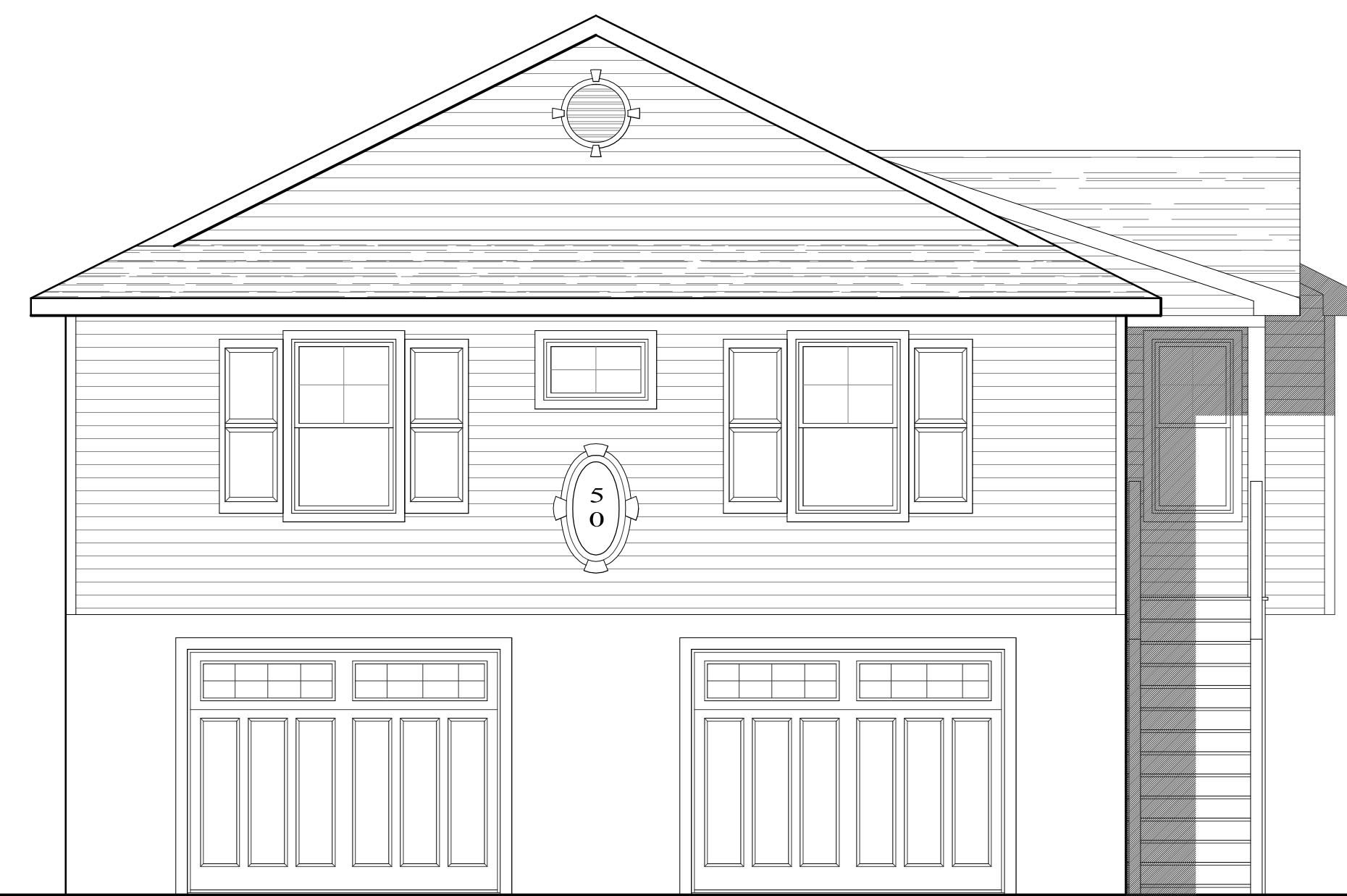
D FRONT ELEVATION